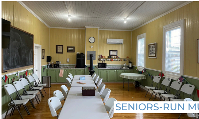
SENIORS-RUN MULTIPURPOSE SPACE