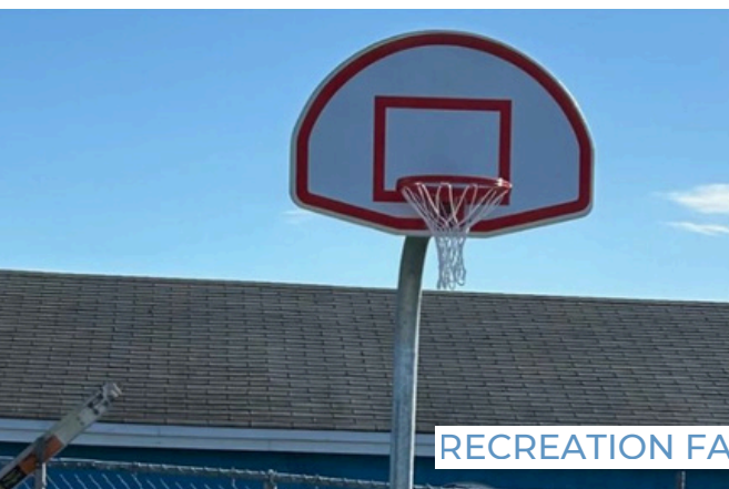
RECREATION FACILITY UPGRADES